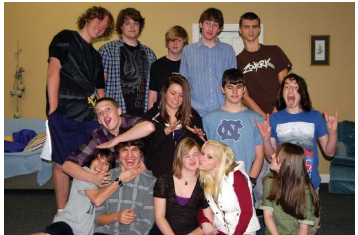
The Masked Knights showing off their personalities