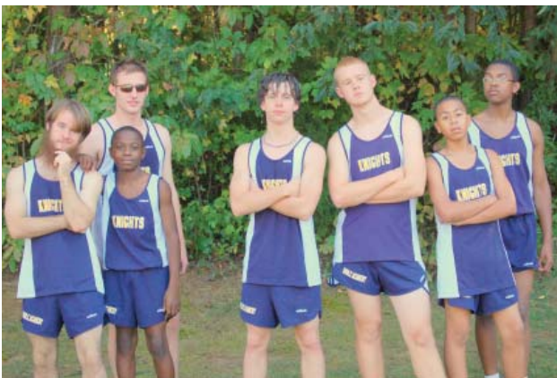
The runners get ready to smoke their competition

Congratulations to all members of the 2010 team for their outstanding effort and dedication.