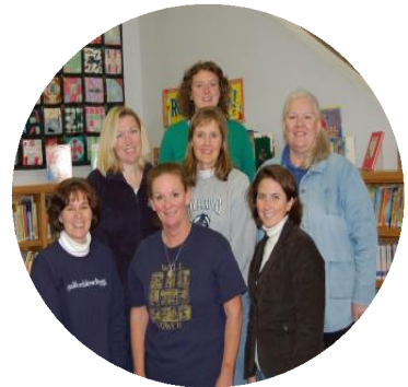
2007-08 Results Committee

During the accreditation team's visit, the peer evaluators will visit classes at all levels, hold several meetings with students, parents, and staff and also look at documentation that substantiates the findings of the Guilford Day School's self-evaluation. The team will be a part of the Guilford Day School family and participate in the full school day including having lunch with students in the multi-purpose room. Before they depart on November 18, the visiting team will report its findings about Guilford Day School to the staff. They will give their recommendations about any improvements that are needed and what the school should continue in its efforts to strive for excellence. The school's chair will submit the evaluation to SAIS in Atlanta and that group will make the decision to grant the dual accreditation for Guilford Day School.