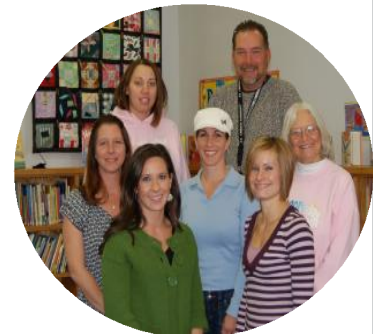
2007-08 Pro Le Committee

The Thinking and Reasoning Committee researched and investigated pertinent studies, methodology, and teaching materials to assist the school in implementing a Thinking and Reasoning curriculum particular to students with learning differences across all grade levels. The committee then took the list of materials dealing with this curriculum and compiled a list of resources that could be purchased for teachers to use in their classes. The members of the committee led a professional development workshop that helped teachers incorporate higher level thinking skills in their instruction.