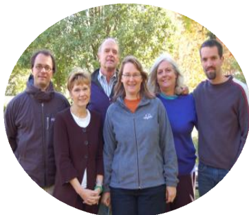
2007-08 Vision Committee

November 16-18, Guilford Day School will host a visiting team of peer educators who will evaluate the school for dual accreditation. The school was first accredited in 1998 by the Southern Association of Colleges and Schools (SACS) and reaccredited in 2003 by that organization. In addition to the SACS reaccreditation, the school will seek a second accreditation from the Southern Association of Independent Schools (SAIS). Guilford Day School became a member of the Southern Association of Independent Schools in the fall of 2007.