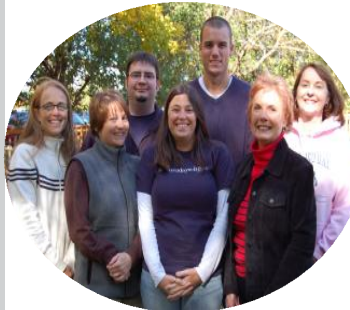
2007-08 Planning Committee

The final year of accreditation involves preparing the School Improvement Plan for the next five years. Four committees formed to tackle this task. The Vision Committee developed new mission statement, belief statement, and vision for the school. The Profile Committee surveyed all of the stakeholders of Guilford Day. The Planning Committee analyzed the data of