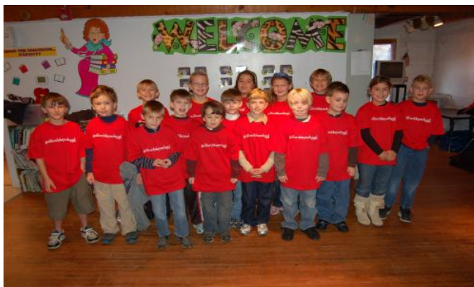
The 2008-2009 Primary Students

In January of 2006 three young first grade gentlemen enrolled at Guilford Day and became the cornerstones of what is now the Primary Division. The 2006-2007 school year started with 13 students in Primary and 2007-2008 began with 19 students in Primary. Currently we have 17 students in grades 1-3 and have seen tremendous growth both socially and academically in our younger students who have