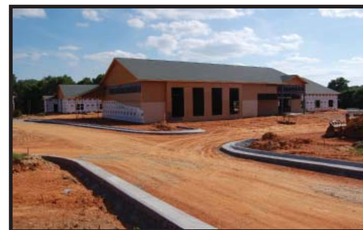
July 14, 2011