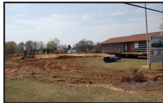
March 21, 2011

We are still on track to open the new building in January!