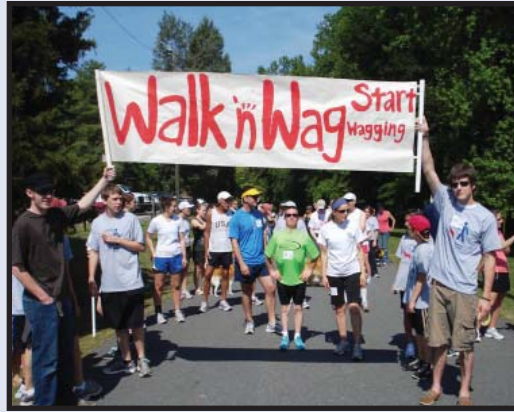
The walk begins!

Walk 'n Wag is a service project led by the students at Noble Academy to give them