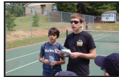
ARF Day - Affixes and Roots Fair - The 9th - 12th grade students planned and carried out activities for the K-8th grade students.