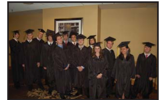
Congratulations to the Class of 2011! Our graduates' plans include community colleges, beauty school, aviation, Greensboro College, Catawba College, mission work, and of course, success!