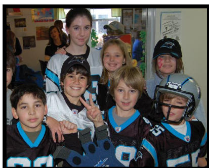
So many Panthers' Fans!!