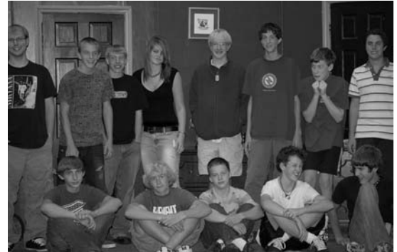
New Students Grades 9-12