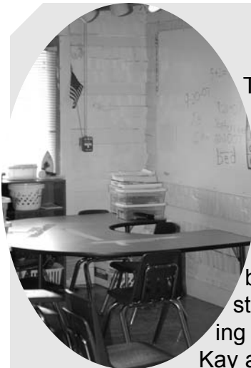
One of the primary classrooms

The Log Cabin has undergone some major renovations in order to make it more functional for our students. A wall was put up in one of the spaces, making two small classrooms for our primary students. The main room in the cabin is used by the primary students for morning meeting and other group gatherings, as well as for music classes.