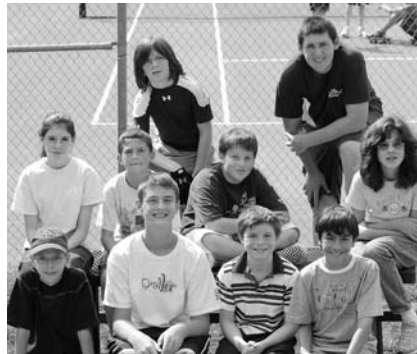
New Students Grades 6-8