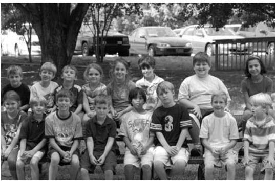
New Students Grades 1-5