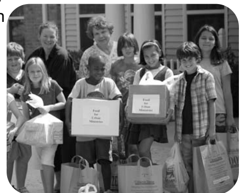
Fourth grade students collecting food for Urban Ministry

The first through fifth grade students attend Enhancement as their last class of the day. Students are split into four groups that rotate through library, keyboarding, dance, and guidance/study skills. This year's Enhancement curriculum incorporates the new and exciting element of community service. Once per week, students will be involved in a service project that will improve the lives of people in our immediate or worldwide community while teaching the students the importance of helping others. Already this year, students have picked up mulch at the playground, made bookmarks for a local nursing home, and collected food for Greensboro Urban Ministries. Other projects on the agenda will benefit our troops overseas and Hospice of Greensboro. The students and teachers are excited about having room in the school day to participate in community service.