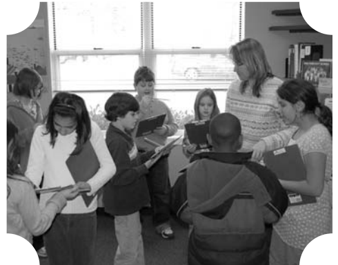
Fourth graders investigate what kind of "smart" they are